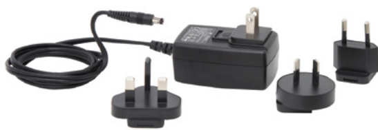
PSU-5VU Universal DC adaptor (Part No: 1180 0049)

Wall power adaptor with interchangeable plug for international use. Universal input: 100-240 V AC, 50-60 Hz, Output: 5V DC, 2.5A