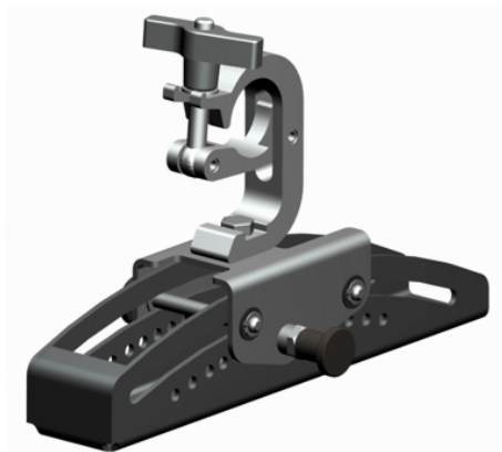
XD15 Universal bracket (Trigger clamp not included)