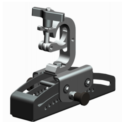
XD12 Universal bracket (Trigger clamp not included)